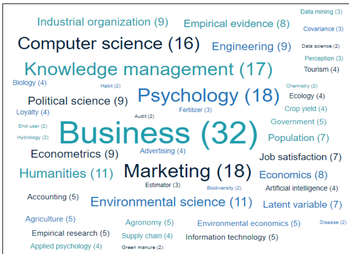
Figure 1 Word Cloud of the Keyword of the Top Field Using PLS-PM

In the past few years, the marketing and management research has been a substantive increase in the number of submissions, dissertations, journals, and publications using Partial Least Square Path Modeling (PLS-PM) techniques (Aimran et al., 2017; Afthanorhan et al., 2018) as displayed in Figure 1. In this analysis, we included keywords related to PLS-PM to better understand the substantive research topic of interest. This recent increase might be due to the increasing number of friendly statistical packages such as SmartPLS, PLS Gui SaaS, WarpPLS, VisualPLS, XLSTATPLS, SPADPLS, Adanco, and PLS Graph. Another reason could be the increased relevant resources explaining its application, such as Hair et al. (2019), Ghasemy et al. (2020), and Ringle et al. (2019).